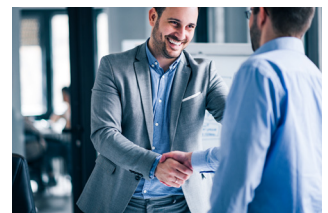
MEET & GREET