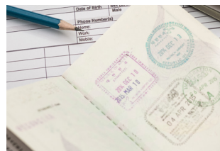
VISAS & WORK PERMITS