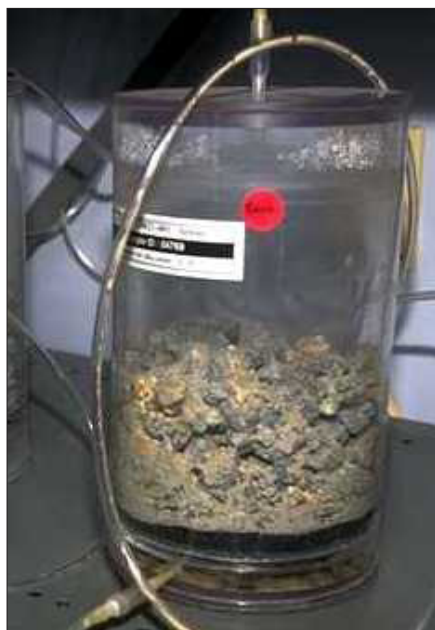
Gold in arsenopyrite