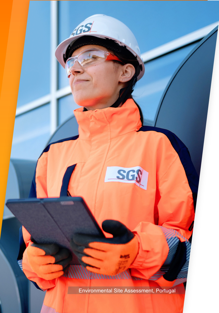
Environmental Site Assessment, Portugal