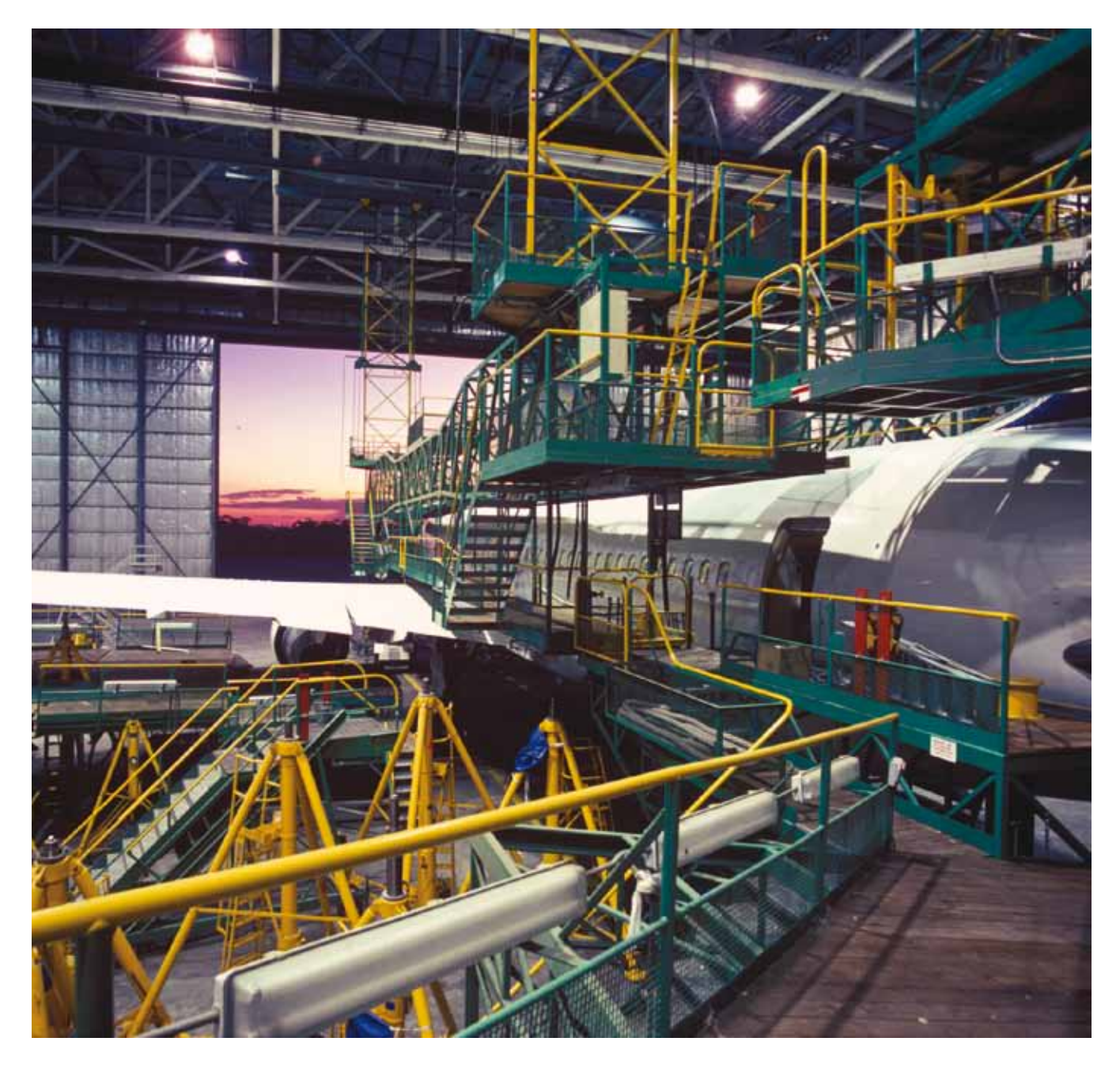
AEROSPACE QUALITY MANAGEMENT SYSTEMS AUDIT, CERTIFICATION & TRAINING SERVICES