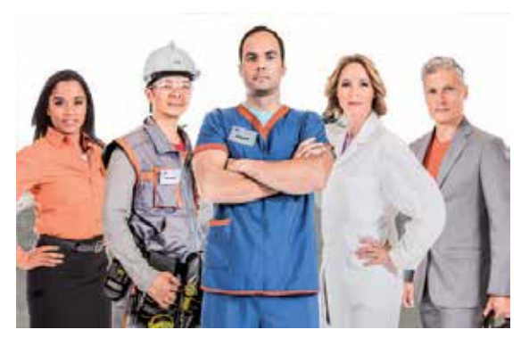
WE SEE THROUGH YOU OPERATIONS AND PROPEL EFFICIENCY