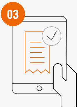
CLEARANCE OF SUBMITTED eINVOICES