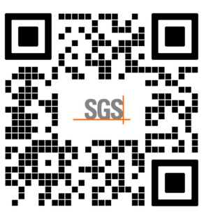
Subscribe to our Newsletter