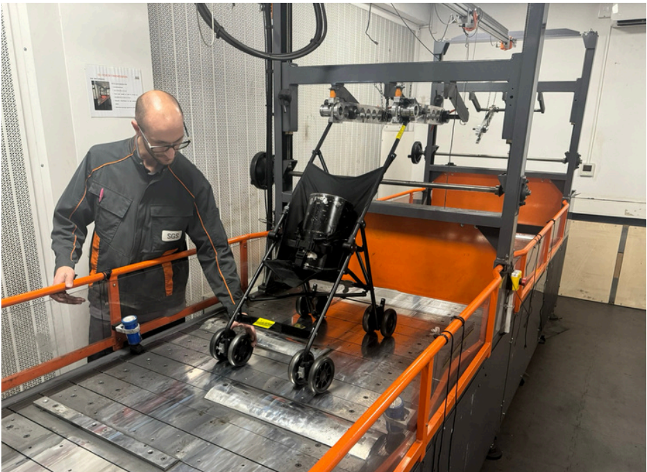
In 2024, SGS has gained GS-Mark lab approval from the German Central Authority of the Federal States for Safety (Zentralstelle der Länder für Sicherheitstechnik - ZLS) for juvenile product testing at its state-of-the-art facilities in Aix en Provence.