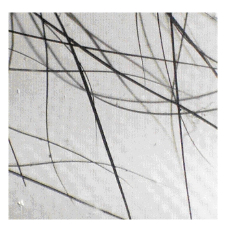
Possum Guard Hair (Magnified)

Because of its short length, test methods developed for wool have had to be significantly modified. SGS has contributed to the commercial development of this fibre by improving or modifying a number of test methods in order to characterise the fibre for yarn and fabric producers.