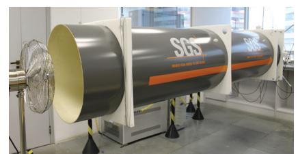
Electrical Efficiency Safety Lab