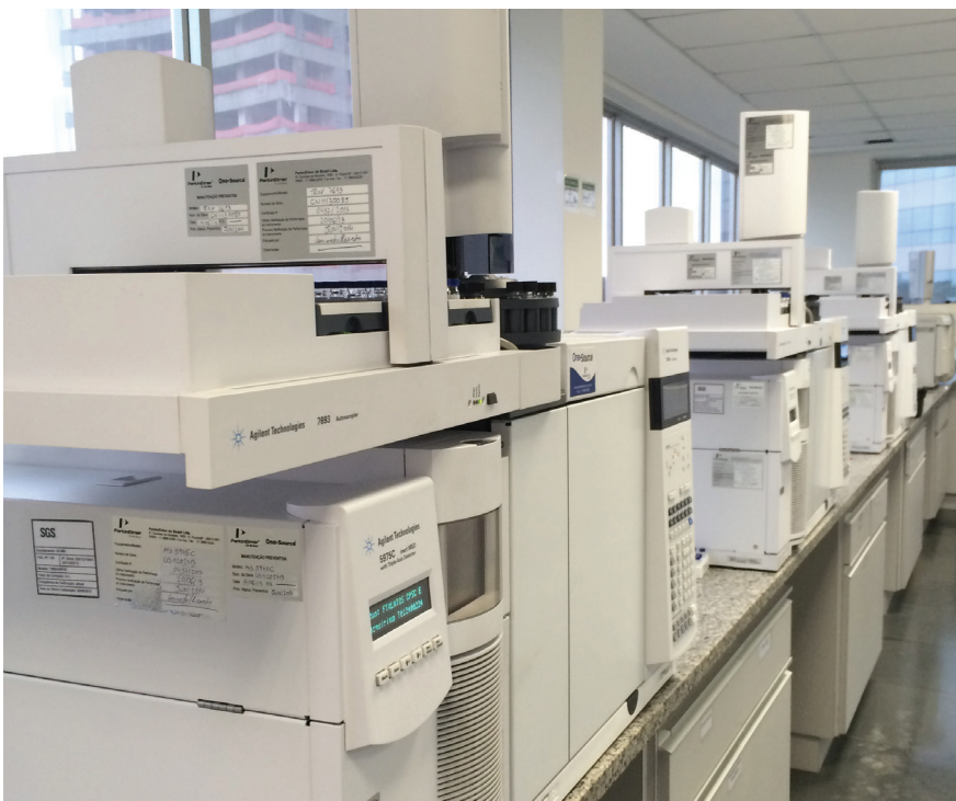
Detergents Testing Lab