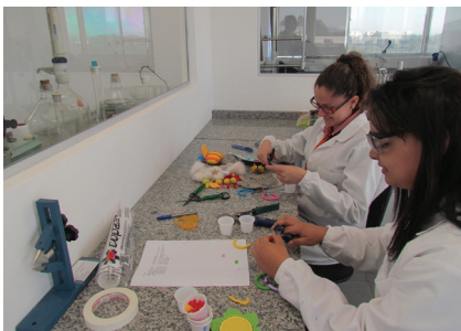
Children's Products Lab