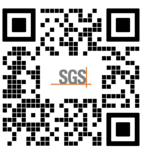
Subscribe to our Newsletter