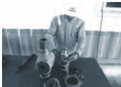
Inspection for worn out parts