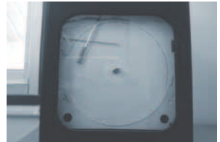
Chart recorder for pressure test