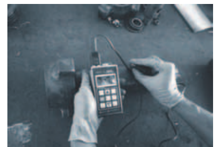
Ultrasonic Wall Thickness readings being taken on various DME parts