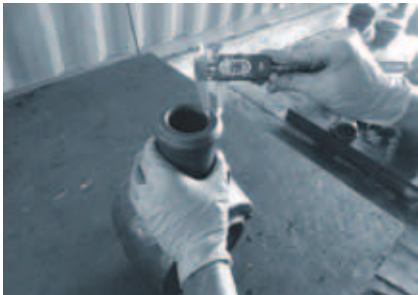
Dimensional Measurements to ensure wear is not below Minimum Dimensions

To compliment the ultrasonic wall thickness readings, dimensional measurements are taken on areas of the equipment that are susceptible to wear. Minimum dimensions are provided by our customer and/or equipment manufacturer to ensure against wear that will increase probability of failure.