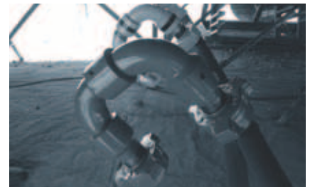
Spray painted DME

After the equipment has been pressure tested it will be spray primed and painted to our customers' specifications. After drying the equipment it is then ID Tagged with metal bands for traceability and identification. Final reports and pressure test charts are issued to the customer to complete the final process.