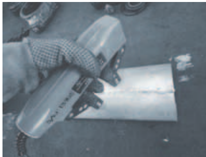
Various DME undergoing NDT and Equipment Calibration

To ensure the equipment has not been over worked or placed under extreme stress, Non-Destructive Inspection & Testing (NDT) is performed. Magnetic Particle (Fluorescent and Black & White) Inspection for ferromagnetic equipment parts and Dye Penetrant Inspection for the non-magnetic equipment is tested to ensure against defects. NDT Inspection & Testing are all performed to ASTM E165 (Dye Pen) and ASTM E709 (Magnetic Particle) or specifications requested by the customer and/or client.