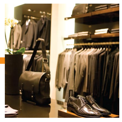
RETAILING How can you ensure the highest safety and quality assurance to your customers?