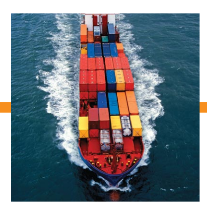
LOGISTICS Do you know the carbon footprint of your products?