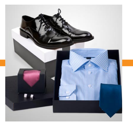
PACKAGING Is your packaging material green enough?