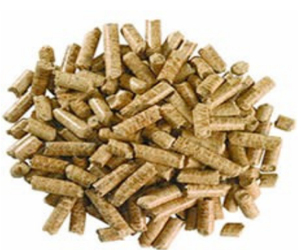
Biomass Feedstock Sample